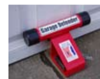
garage door defender