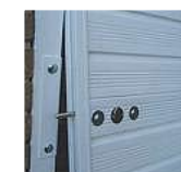
garage locking bolts